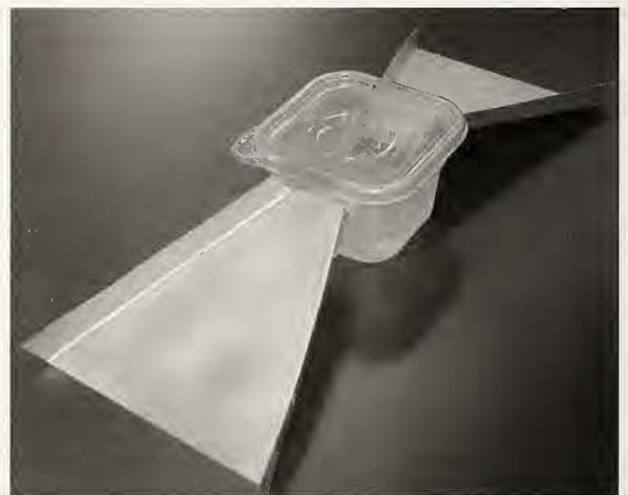
Figure 1.—A typical ramp trap used in this experiment.

When sampling started, an identical transect of three ramp traps was set 8 m from and parallel to each transect of pitfall traps. Ramp trap design followed Bouchard et al. (2000), with modifications described hereinafter (see Fig. 1). We used 946 mL plastic 12 cm × 12 cm × 8 cm (L × W × H) containers with ramp entrances on